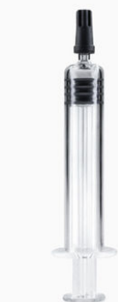
5ml luer glass syringe